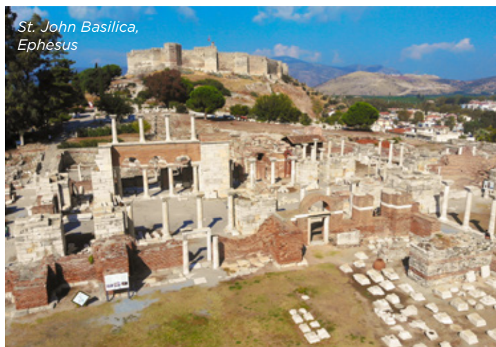
St. John Basilica, Ephesus

After breakfast, depart from the hotel at 08:30 am. Drive to Selcuk town to visit the Greco-Roman city of Ephesus. Shopping opportunity in the afternoon. Return to Kusadasi on the shores of the Aegean Sea. Dinner and overnight at the Ramada Hotel in Kusadasi. (B,D)